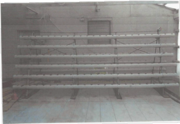
A-frame NFT tower