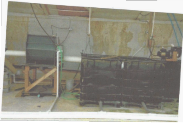
Drum filter, IBC totes with biomed