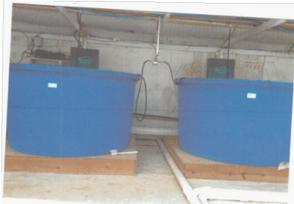
1200 gallon, 8' diameter, Poly tank, round