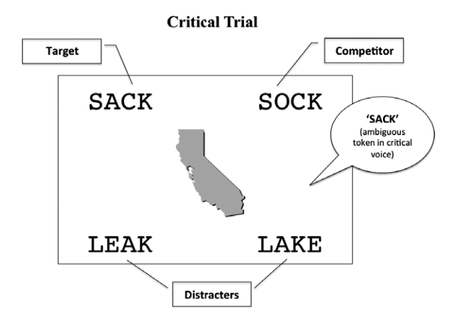
Figure 1: Example critical trial screen. The icon is an outline of the state of California. Word in bubble indicates auditory token played

Only critical trials were analyzed in this study, but filler trials in both the voice used in critical trials and in a distracter voice were included to obscure the focus on TRAP in this study. Listeners completed a total of 32 total trials, 16 in the critical voice (including the four critical trials), and 16 in the