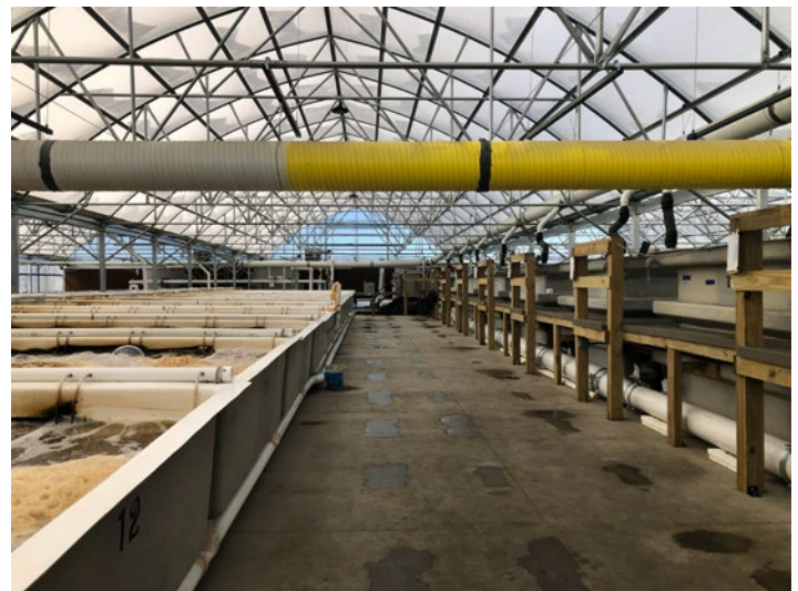
Figure 4. Example of a tilapia recirculating aquaculture system within a greenhouse in the Midwest.

Aquaponics (Figure 6) is not a new production system concept, and over the last few decades these systems have exploded in popularity. Aquaponics is being increasingly adopted by the public for self-consumption, as well as rural and urban farmers, faster than research can be conducted to generate design, management recommendations, and economic analyses. Aquaponic systems in the Midwest are