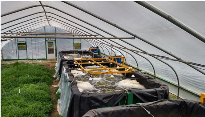
Figure 7. Example of a saltwater shrimp biofloc system within a hoop house.

similar to RASs in that these are usually built indoors, consist of a culture tank and filters, and require oxygen to be provided for the bacterial community and aquatic animals. The difference is the inclusion of a hydroponic (plant culture) component that commonly acts as an additional filter as well as a revenue generator to support cash flow. The hydroponic component of the system may be located within greenhouses or entirely indoors under controlled lighting. The marriage between aquaculture and hydroponics frequently finds its way into schools as part of a science, technology, engineering, and math (STEM) focus. Teachers can work with students to teach them about the biology of the system (including the bacterial communities that liberate nutrients from uneaten food and animal waste), the design and water flow of the system, as well as the economics involved. Several Extension publications are available regarding desired recommendations for aquaponics (NCRAC Technical Bulletin 123 and 124, SRAC 454, SRAC 5006, and SRAC 5009).