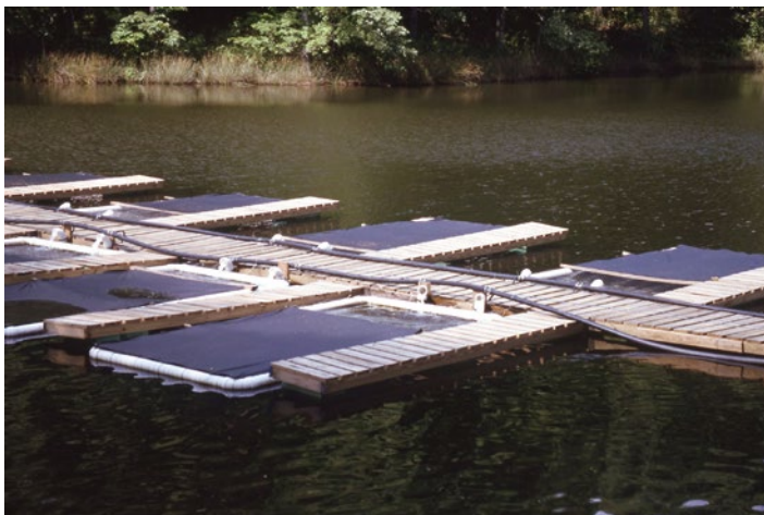
Figure 8. Example of cage culture.