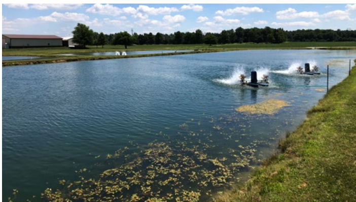
Figure 3. Example of a yellow perch levee pond culture facility in the Midwest.

Pond culture (Figure 3) is the oldest and most popular aquaculture production system worldwide. Pond culture systems should be designed specifically for aquaculture, as there are general recommendations in terms of soil