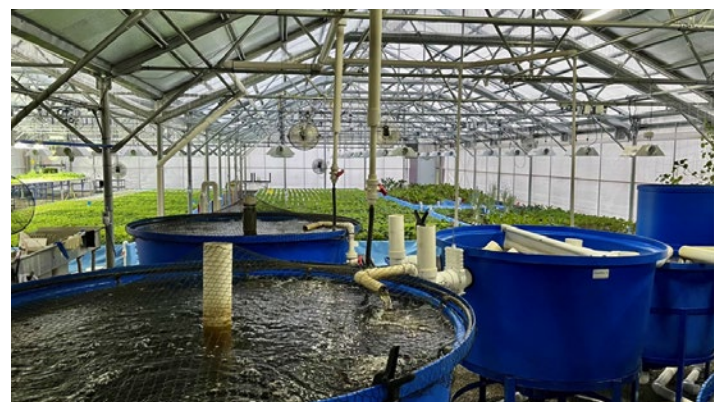
Figure 6. Example of a tilapia coupled aquaponics system within a greenhouse in the Midwest. Photo of Roothouse Aquaponics in Ohio.