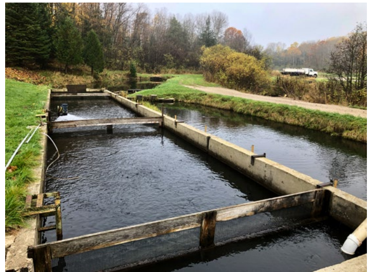
Figure 5. Example of a rainbow trout raceway system in the Midwest.