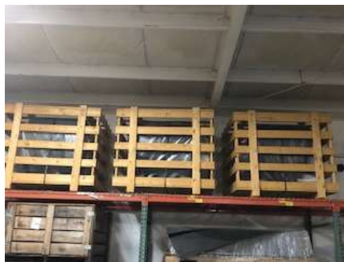
801 Hydrotech Microscreens ($11,000)