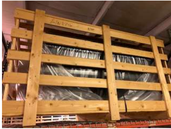
803 Hydrotech Microscreens ($18,000)