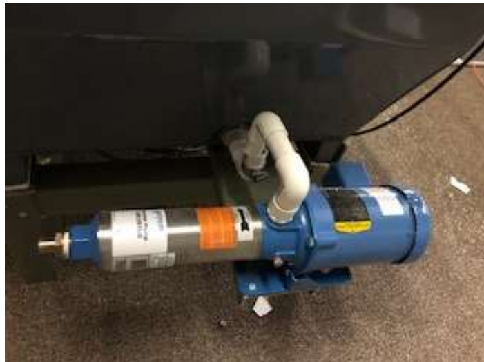
1HP Booster Pump