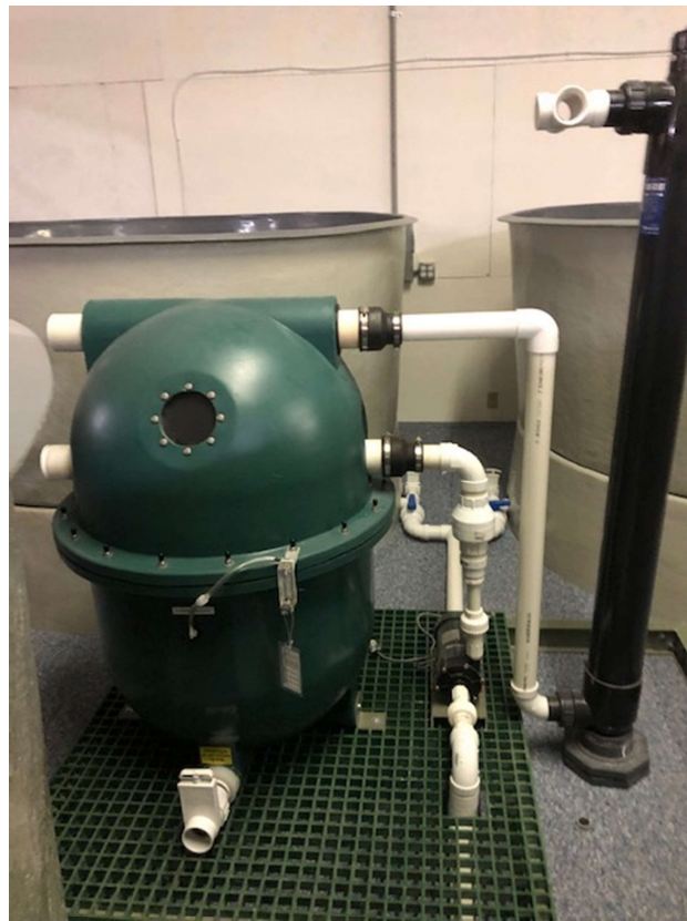
Water treatment skid: Polygeyser bead filter ($2850) UVHO 150 watt UV sterilizer ($913) Magnetic Drive Pump ($4640)