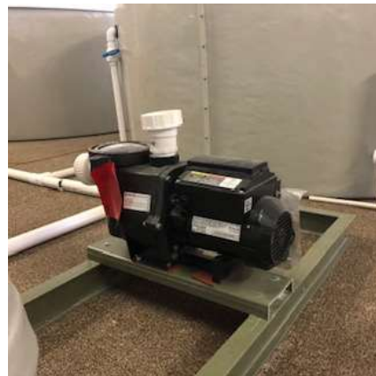
Skidded 801 Hydrotech Microscreen w/ high pressure pump ($700), and 6" actuated valve ($900) Sparus Pump with Constant Flow Technology