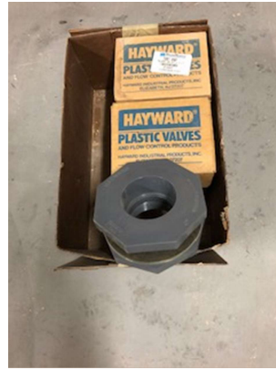
3 - Hayward 4" Bulkhead Fittings