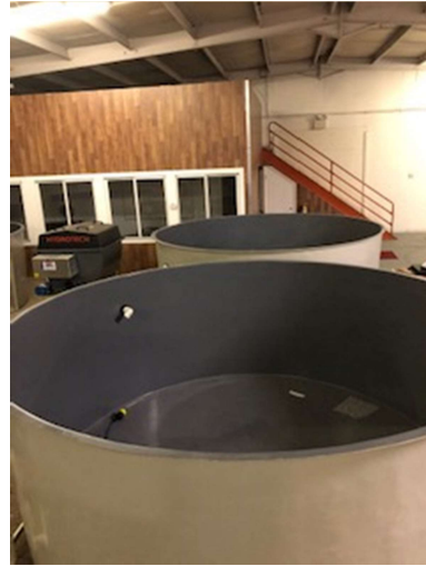
4 - 10' diameter fiberglass tanks Skidded Oxygen Saturator / Sparus Pump DO monitoring