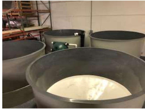
4 – 7.5' diameter cone-bottom tanks (@ $1825)