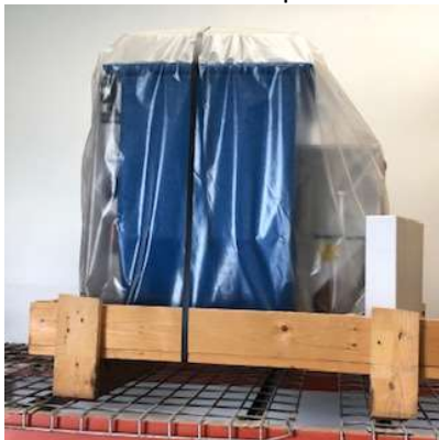
501 Hydrotech Microscreens ($5000)