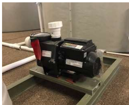
Sparus Pump (with constant flow technology) ($1140)