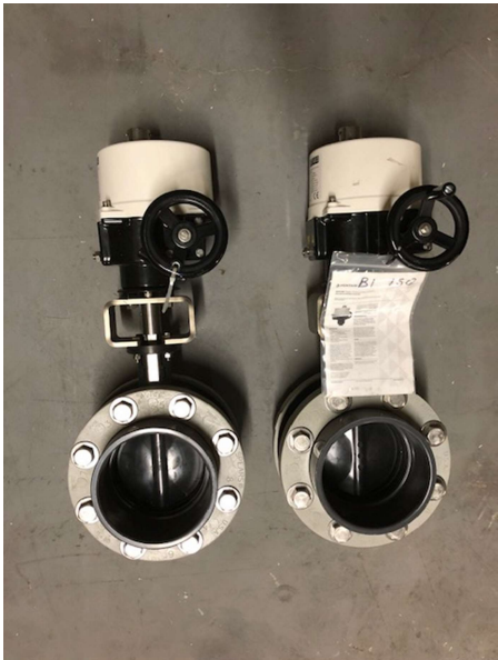
6" - Electrically Activated Butterfly Valves