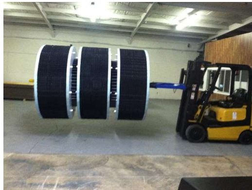
2 - Rotating Biological Contactors (15,000 sq ft, floating/air/water driven)