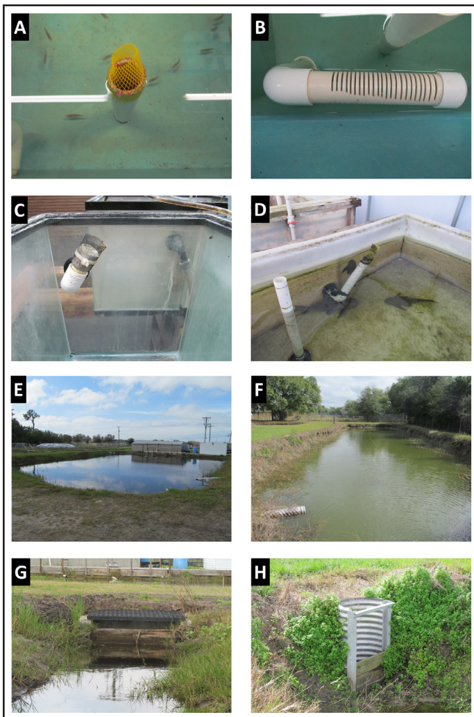
Figure 3. Examples of physical barriers used at a tropical fish farm. Similar physical barriers may be used at other types of aquaculture facilities, scaled to appropriate sizes. Barriers include screens on tanks vats (A, B, C, and D), detention pond (E; water is eventually discharged), retention pond (F; water is not discharged), and riser board control structures (G and H).

Also called a flash-board riser, the riser-board control structure is a common feature of aquaculture facilities throughout the southeast. Riser-board control structures are typically placed in ditches and can be constructed of galvanized steel pipe or the more expensive concrete structure. Both the galvanized pipe and concrete structure will have guides where slats can be placed, typically wood, but other materials are also used; placement of additional slats can then raise or lower the water level in the ditch, which can alter residence time and prevent the release of sediments and wastes. However, despite the fact that this structure is a common feature of aquaculture facilities, it is not known how effective they are in preventing aquaculture escape. This could be due to variation in species behavior, which, our research suggests, leads to variable movement over the riser board. Screens placed behind or