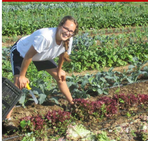
Providing women with tools to improve their risk management skills in the complex, dynamic world of agriculture.