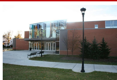
Boyd Cultural Arts Center and Auditorium on the Wilmington College Campus

WILMINGTON COLLEGE is located at: 1870 Quaker Way, Wilmington, OH 45177