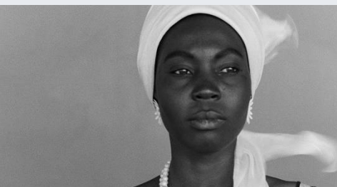
Black Girl

Working with OSU faculty and listening to student feedback, the Wex continues this series with an enticing and eclectic array of classics that will compliment and expand your appreciation of film history!