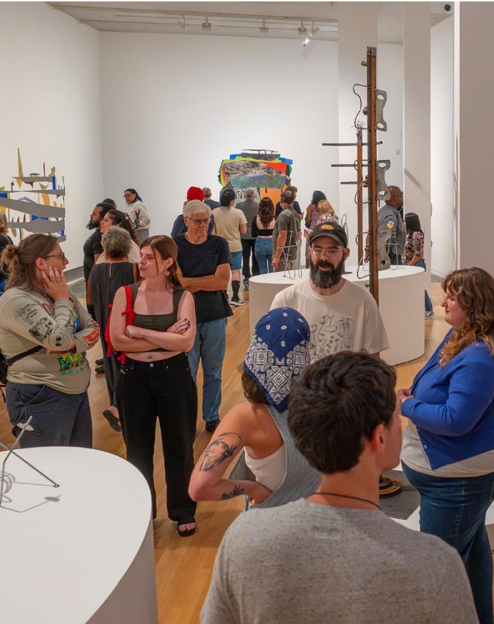
Fall 2025 Exhibitions Opening.