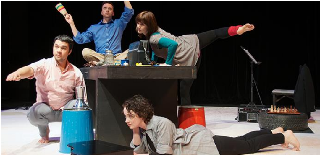
John Cage 101