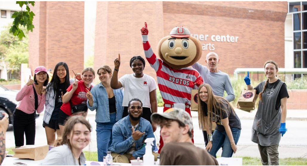
Ohio State students and staff pose with Brutus Buckeye at the Wex Open House, 2024