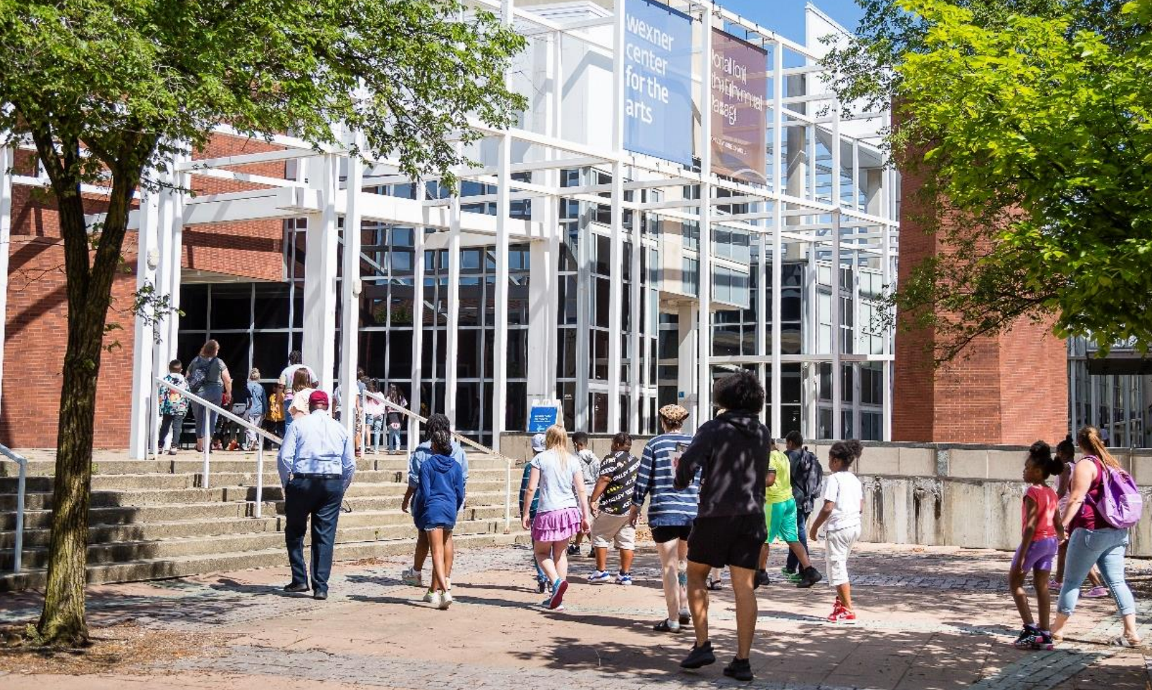
Columbus City Schools students and educators enter the Wex for a gallery learning experience.