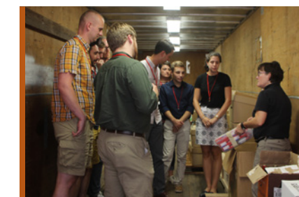
Attend hands-on training at PNNL and HAMMER training facilities.

Fellows make programmatic contributions across both the technical and policy realms. After their fellowships, fellows are highly sought after by employers in national security and related fields, with many going on to positions with government agencies, national laboratories, non-government organizations, industry, academia, and other organizations worldwide.