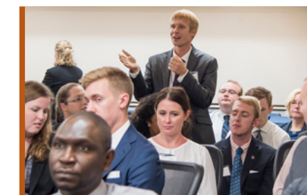
Communicate national security technology and policy solutions.