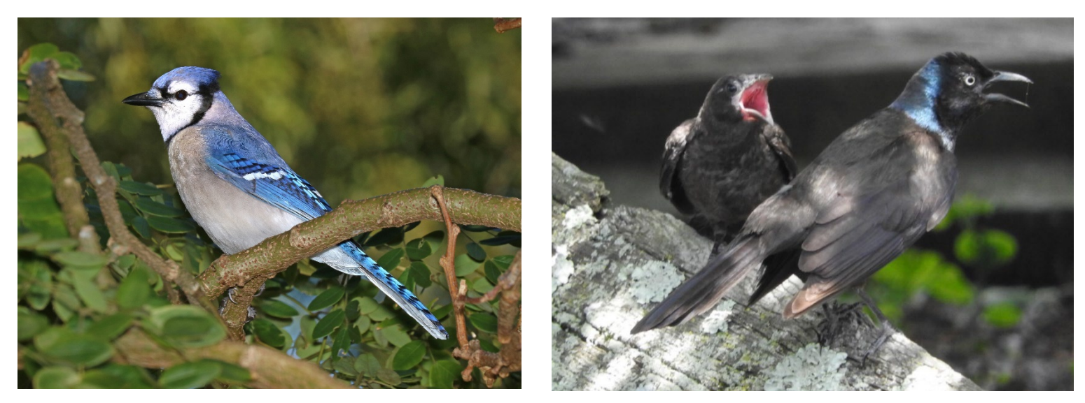
Blue jays (left) and common grackles (right) are one of several species that have been reported as sick/dying.

Clean and disinfect bird feeders and bird baths.