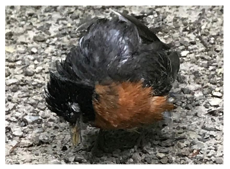
American robin displaying symptoms. This picture was taken by Kristi Anderson and posted to the Preservation Parks of Delaware County Facebook page on June 15,2021.

The illness appears to affect multiple species of birds. In Ohio, primary bird species affected include blue jays, common grackles, house sparrows, European starlings, and American robins. Other common backyard birds may also be affected. Currently, no reports exist of other animals being impacted by this illness or its symptoms.