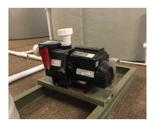
Sparus Pump (with constant flow technology) ($1140)

2 - Rotating Biological Contactors (15,000 sq ft, floating/air/water driven)