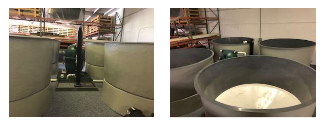
4-7.5' diameter cone-bottom tanks (@ $1825)