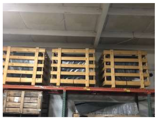
801 Hydrotech Microscreens ($11,000)