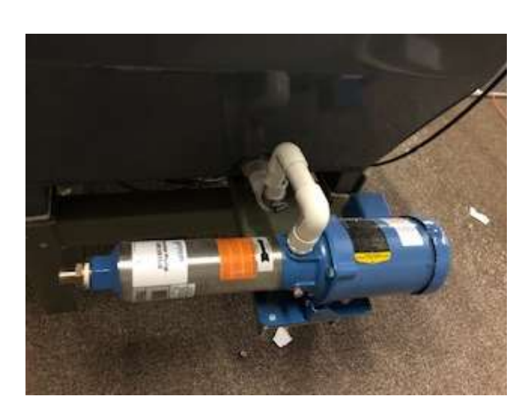
1HP Booster Pump