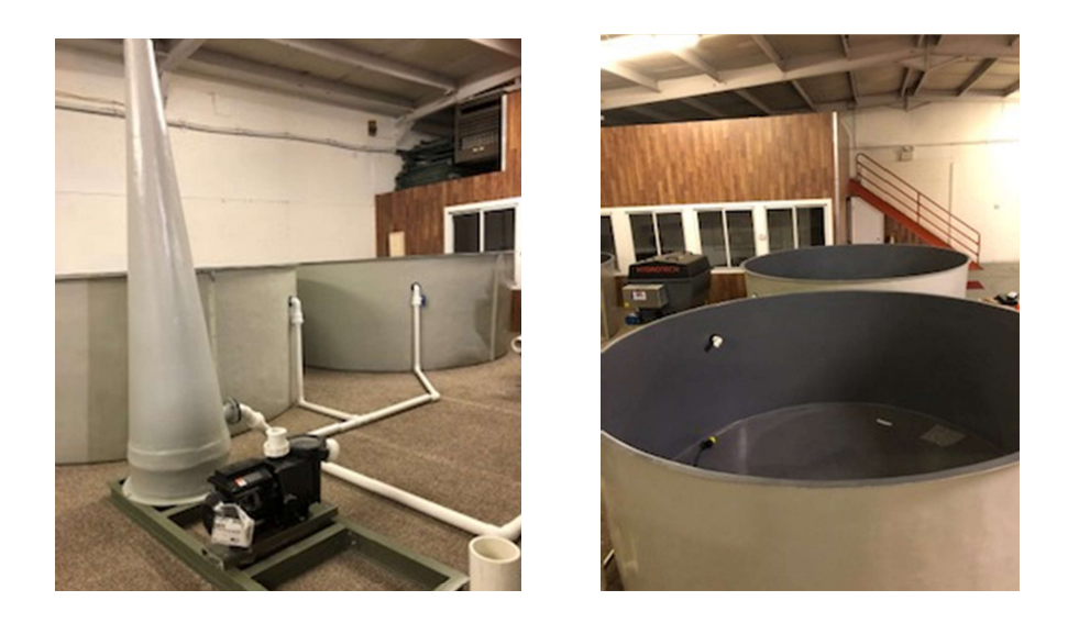
4 - 10' diameter fiberglass tanks Skidded Oxygen Saturator / Sparus Pump DO monitoring