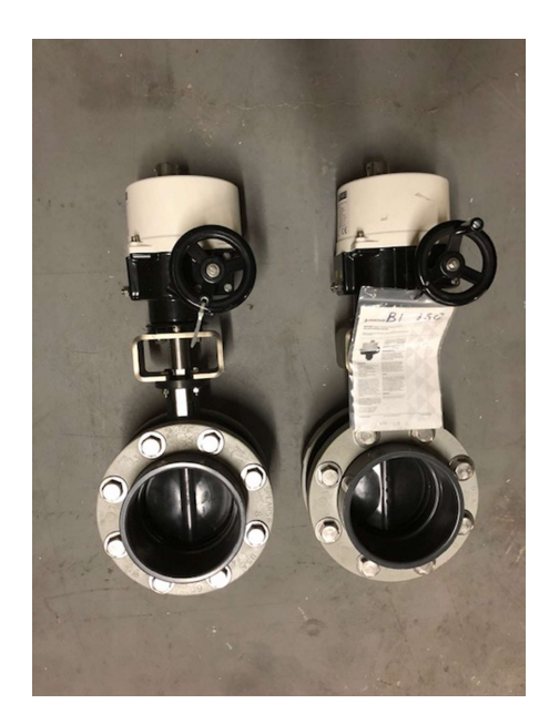
6" – Electrically Activated Butterfly Valves