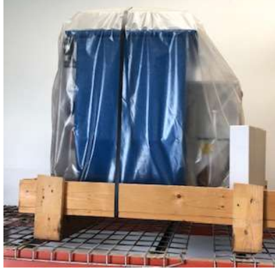
501 Hydrotech Microscreens ($5000)